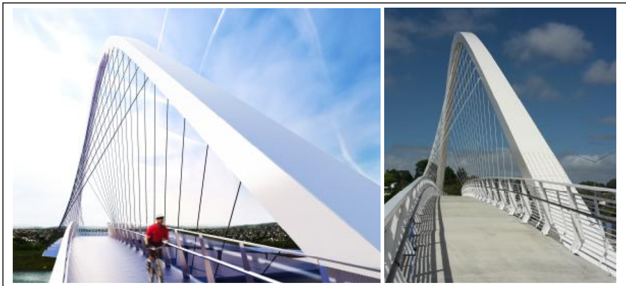
Figure 4. Concept design of hanger arrangement compared with site photo.

All the elements of this composition are functional structural members and nothing is superfluous. The design team's aim was to create architecture from pure structural form without adornment or unnecessary features. The shaping of the arch, girders, footings and deck is designed in response to the flow of forces to the ground. The members are as slender as can be to resist the gravitational, seismic and wind load effects on the structure. The connections and details are intended to appear as simple, uncluttered and elegant as possible to contribute to the overall aesthetic.