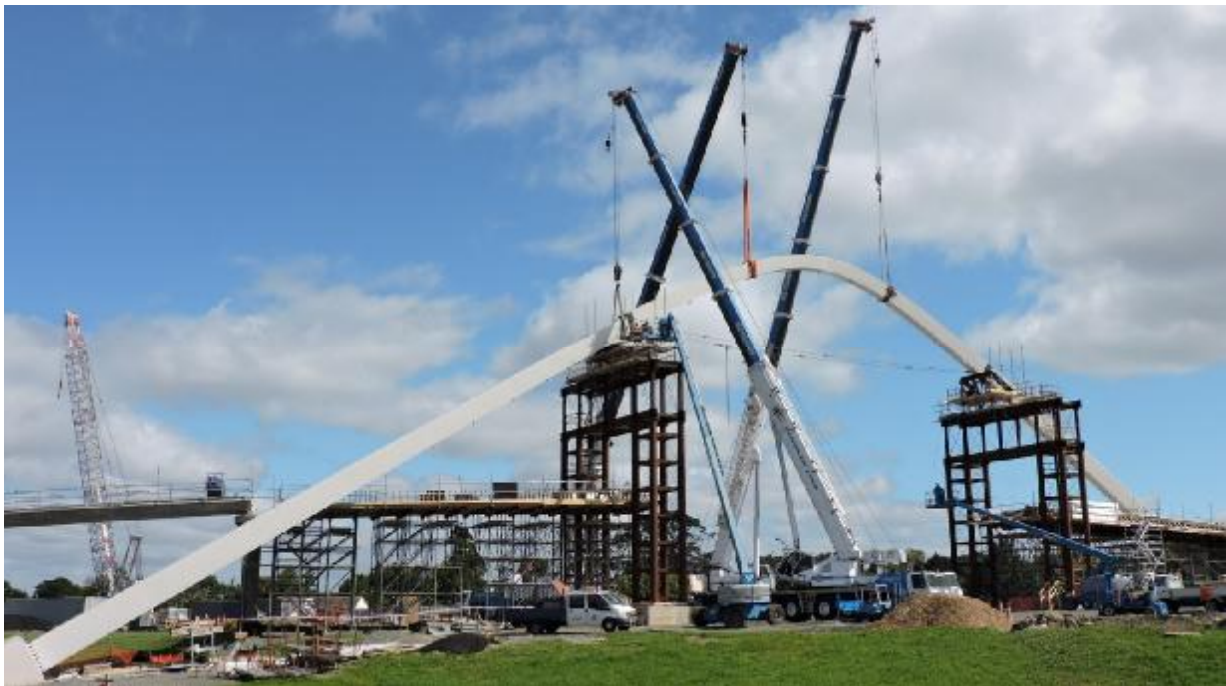
Figure 8. Arch segment being lifted onto temporary towers.

Installation by crane was successfully carried out in December 2015 after the TBM had been removed from site along the haul road through the bridge site. After the arch was up and secured in place, deck construction commenced in 2016. The photo in Figure 8 shows the central arch segment being erected.