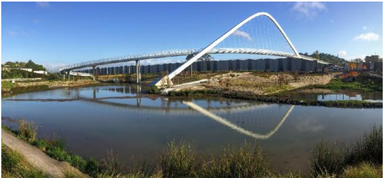
Figure 10. Hendon Park Footbridge viewed across Valonia Wetland.

The success of the bridges will be judged during the coming years, if the community start using the new facilities in their neighbourhood, if more people are encouraged to ride their bikes for recreational trips and commuting, and if drivers passing beneath the Hendon Park Footbridge enjoy a dramatic moment on their journey through this gateway to Waterview.