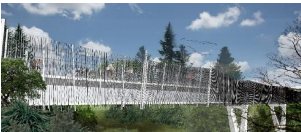
Figure 2. Alford Street Bridge over Oakley Creek.