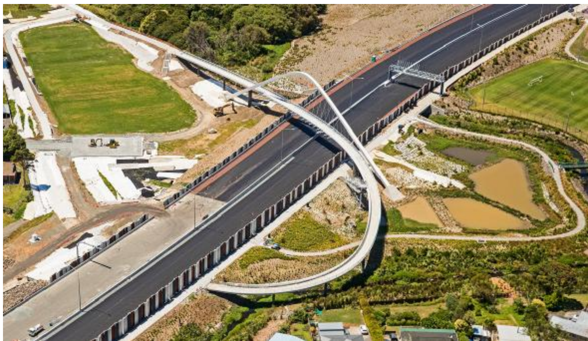
Figure 3. Aerial view of Hendon Park Footbridge under construction.

The geometrical shape of the shared path springs directly from the site constraints. In order to rise over the road and rail envelope with safe clearance a 120m long southern approach ramp climbs at 7%. Six southern approach spans cross the re-aligned Oakley Creek twice and a new wetland. The arch footing is actually located in the stormwater pond with planting over the submerged footing. The curve of the southern approach ramp provides the maximum possible radius for cyclists that fits within the site boundary. The northern ramp is aligned hard up alongside Oakley Creek with a green mechanically stabilized earth (MSE) wall dropping onto the stream bank. On the west side an embankment slopes down to a new football pitch. Figure 3 shows an aerial view of the bridge in its urban context during construction.