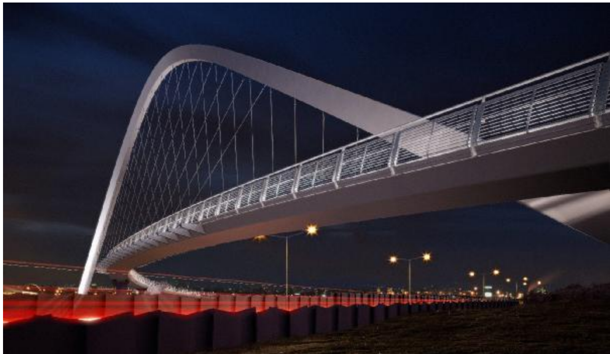
Figure 1. Architect's render of Hendon Park Footbridge.

Keywords: Shared Path, Footbridge, Architectural, Innovative Construction.