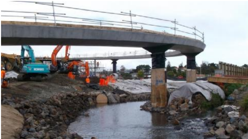
Figure 6. Oakley Creek being re-aligned under Southern Approach Spans.

The first stage of construction of the bridge began with foundations for the southern approaches and the arch footings. The site is underlain by a basalt flow which thins out towards the southern boundary. The Oakley Creek was to be re-aligned from a Victorian era man-made trench structure to its old natural flow path around the edge of the basalt. The bridge spanned the re-aligned creek and in order to make construction most efficient the southern approaches were built first, allowing the stream works to follow on under the bridge as shown in Figure 6.