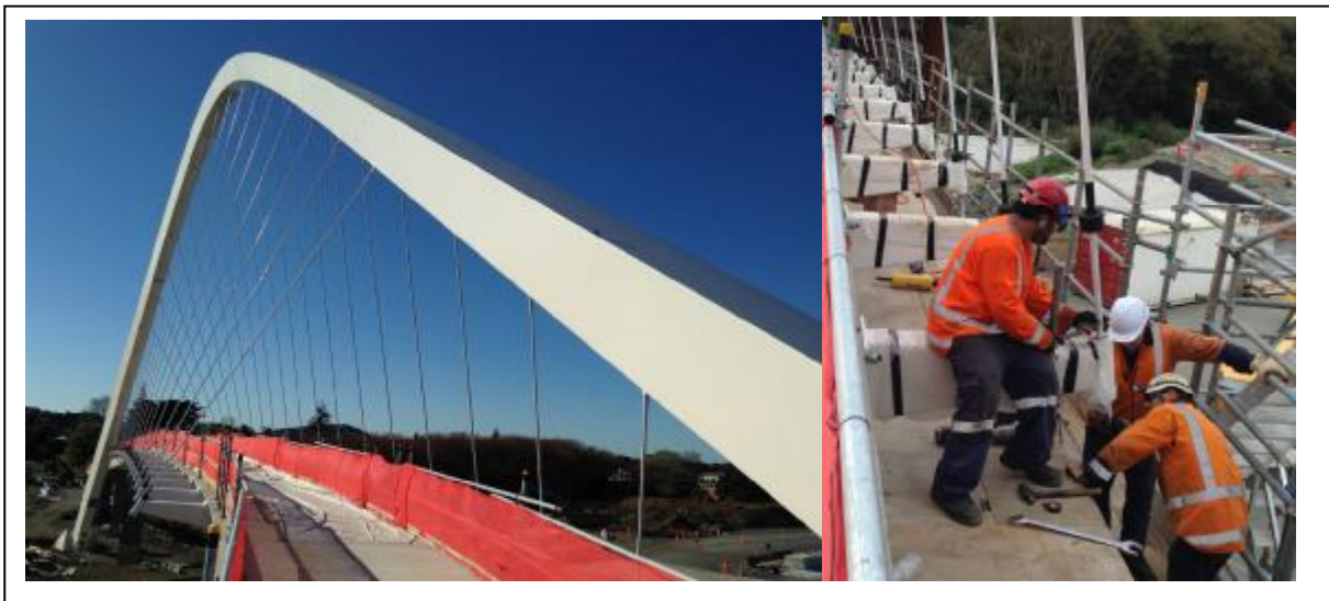
Figure 9. Hanger stressing and arrangement after removal of deck falsework.

The stressing proceeded without hitch and deflections at each stage confirmed the intended behaviour of the structure and final geometry. A round of load take-offs and re-stressing of some of the outer hangers that were found to have lower than predicted tensions completed the operation. At this stage the deck could be seen to have just lifted off supporting falsework with tiny gaps appearing. So when the falsework was removed the design and construction team was confident that there would be no significant movement.